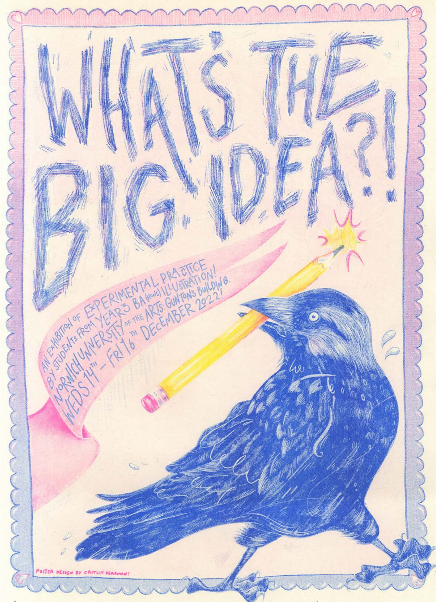
(Left) The Pebble Collector Two layer risograph print, aiming to educate about caching: a fascinating corvid behaviour.

Caching is a behaviour exhibited by many birds, particularly corvids. It involves collecting and hiding objects that are of interest to them.