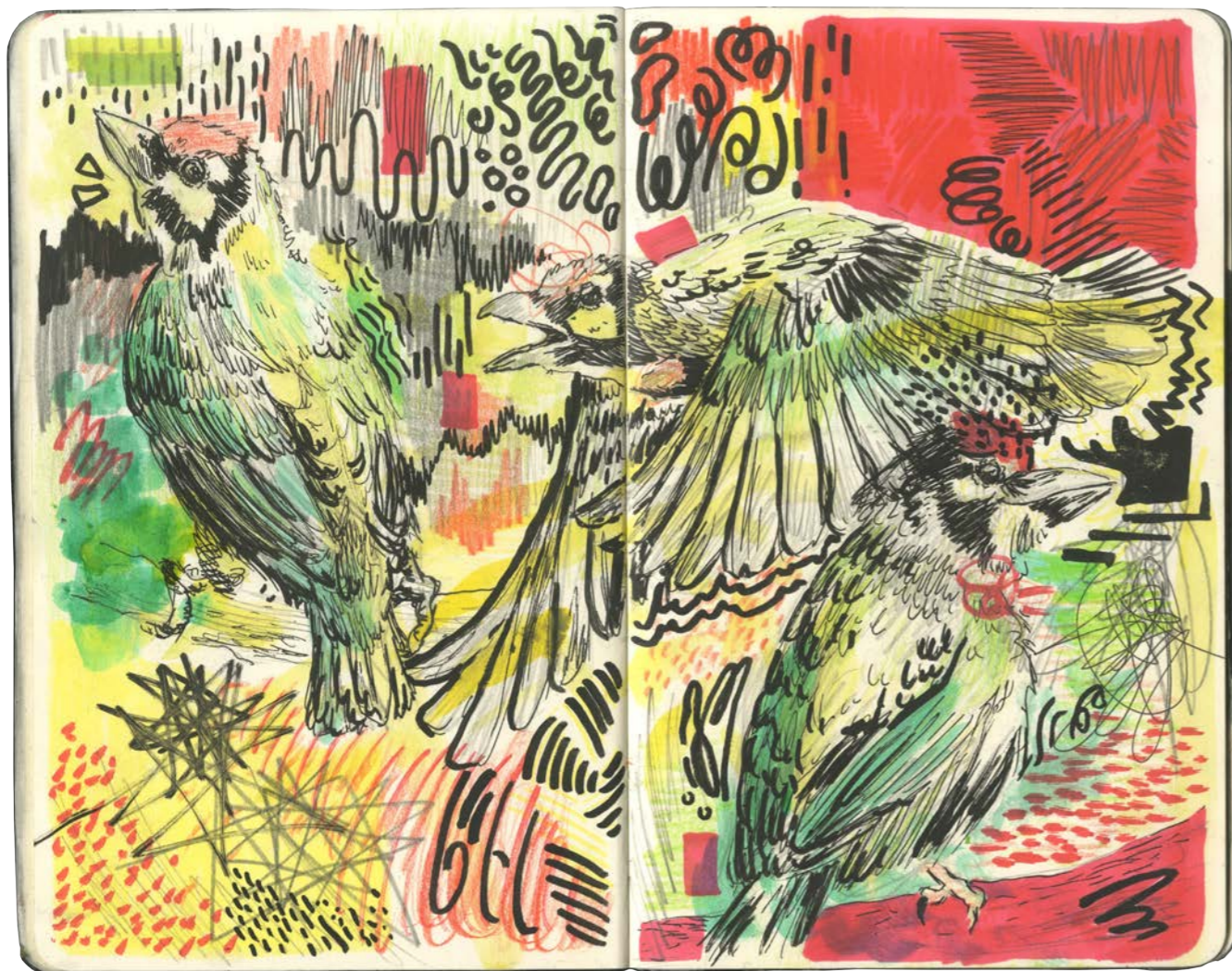
(Left) The Coppersmith Barbet Sketchbook spreads exploring the visualisation of sound and the coppersmith barbet, a bird named after its loud, clanging call.