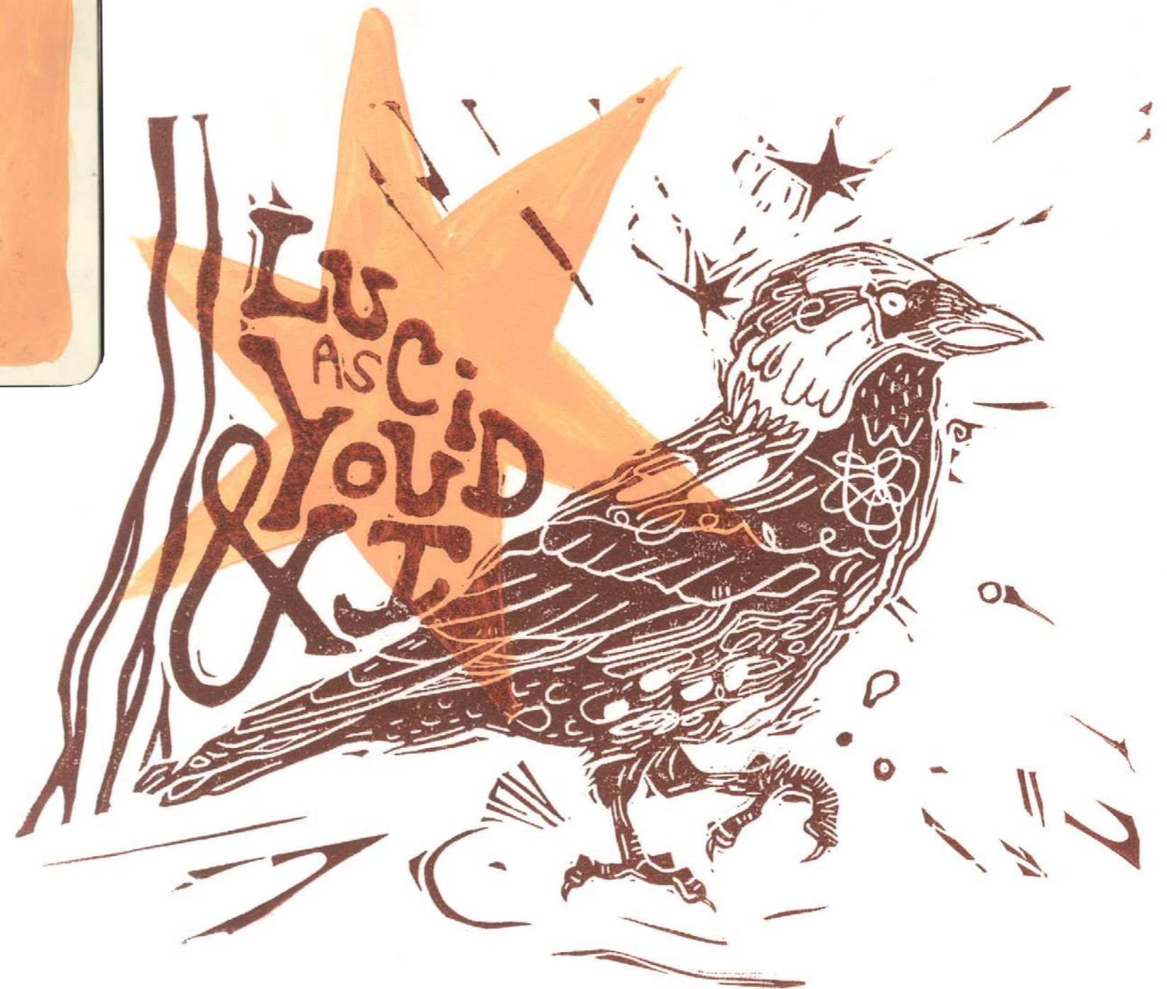
(Right) Lucid as You and I A linocut print stemming from the above painting, aiming to capture the magic of the bird species we are lucky to share the Earth with.