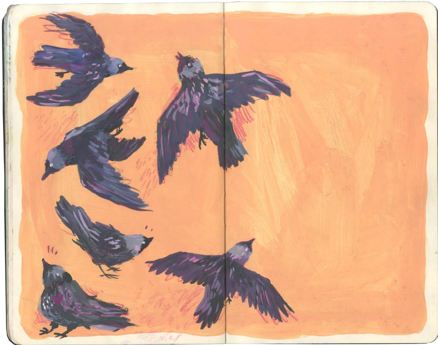
(Left) Jacks in the Park Gouache and coloured pencil, sketchbook spread painted from life.