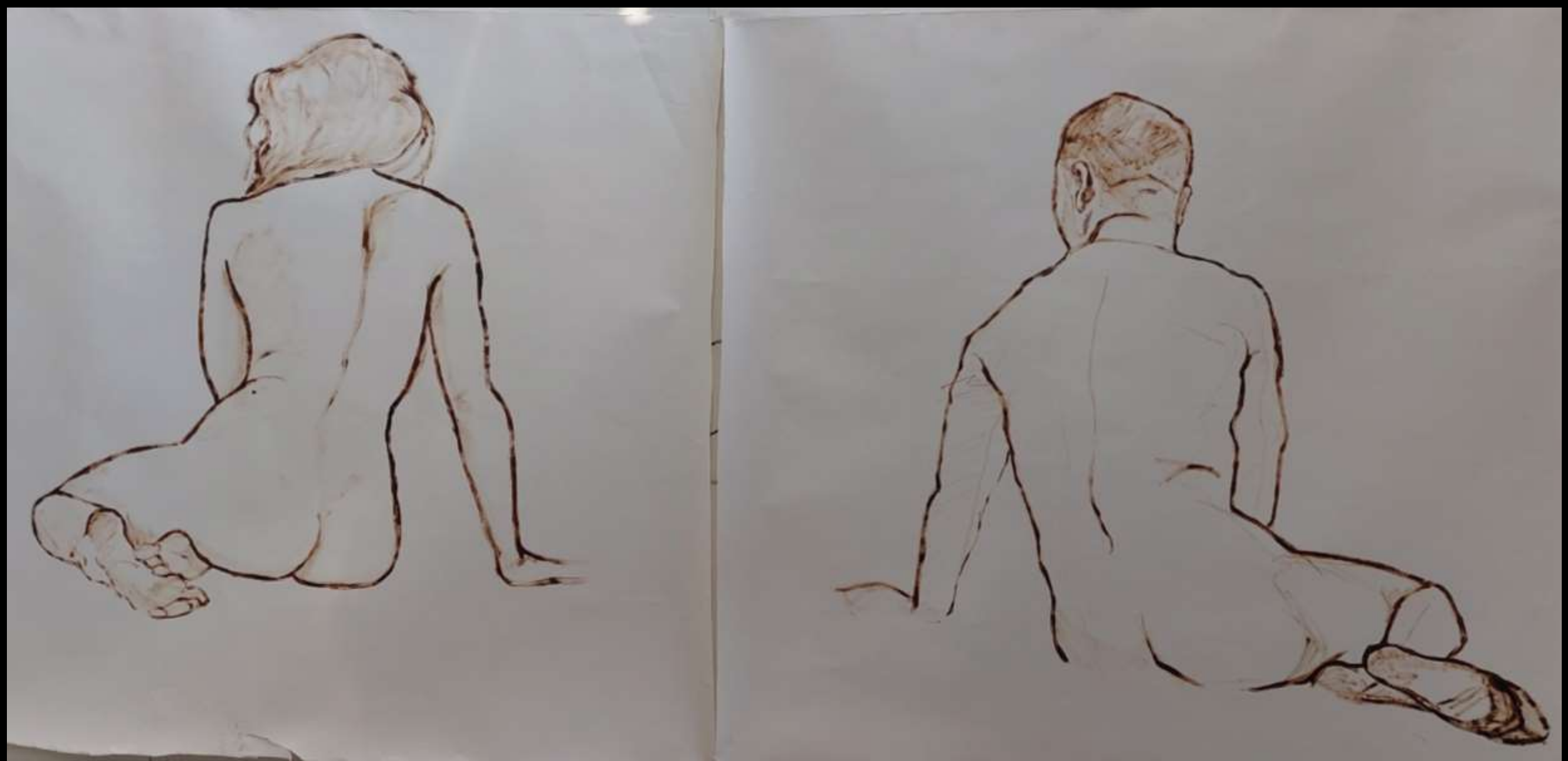
Untitled , (2023), Rose Willis, Oil paint on paper, 20cmx90cm, This work is collation of ideas on the difference in the objectification of female and male bodies as well as gender dynamics within intergender relationships.