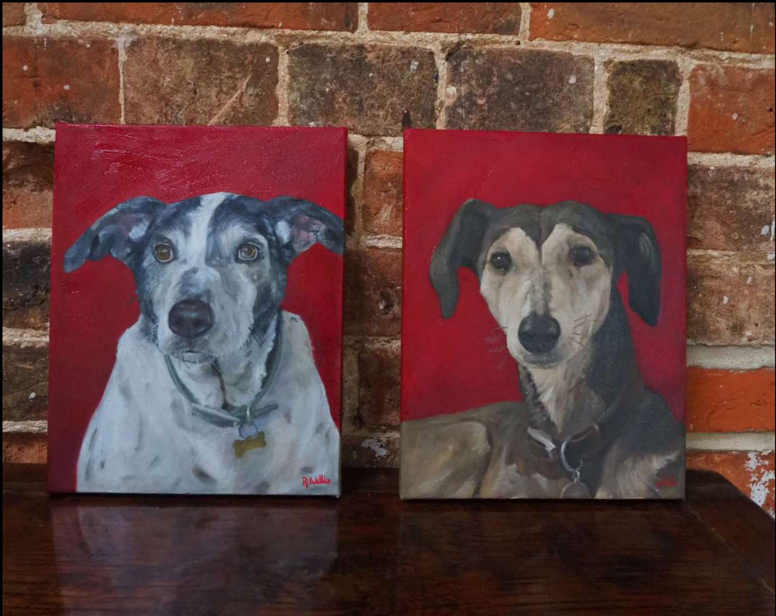
Snoop and Suki , (2019), Rose Willis, Oil paint on canvas, 18cmx25cm, These dog portraits are a diptych of family pets, a simple pair of paintings for a simple brief.