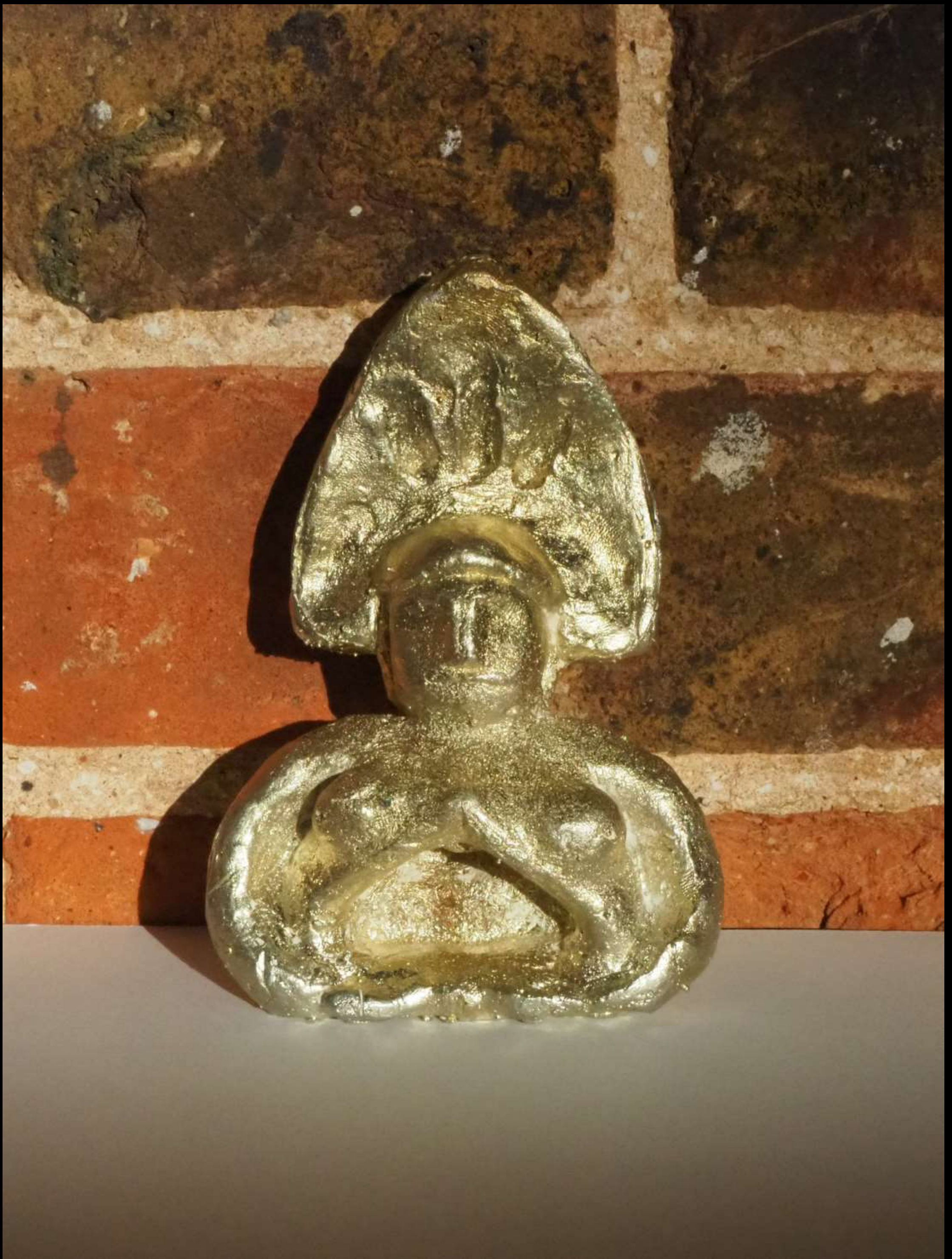
Fertility Deity , (2018), Rose Willis, Cast pewter, 12cmx10cm - This deity is a representation of the process of creating life, have aspects of the female and male contributions to this through combining sexual physical features and exposing the womb and foetus within.