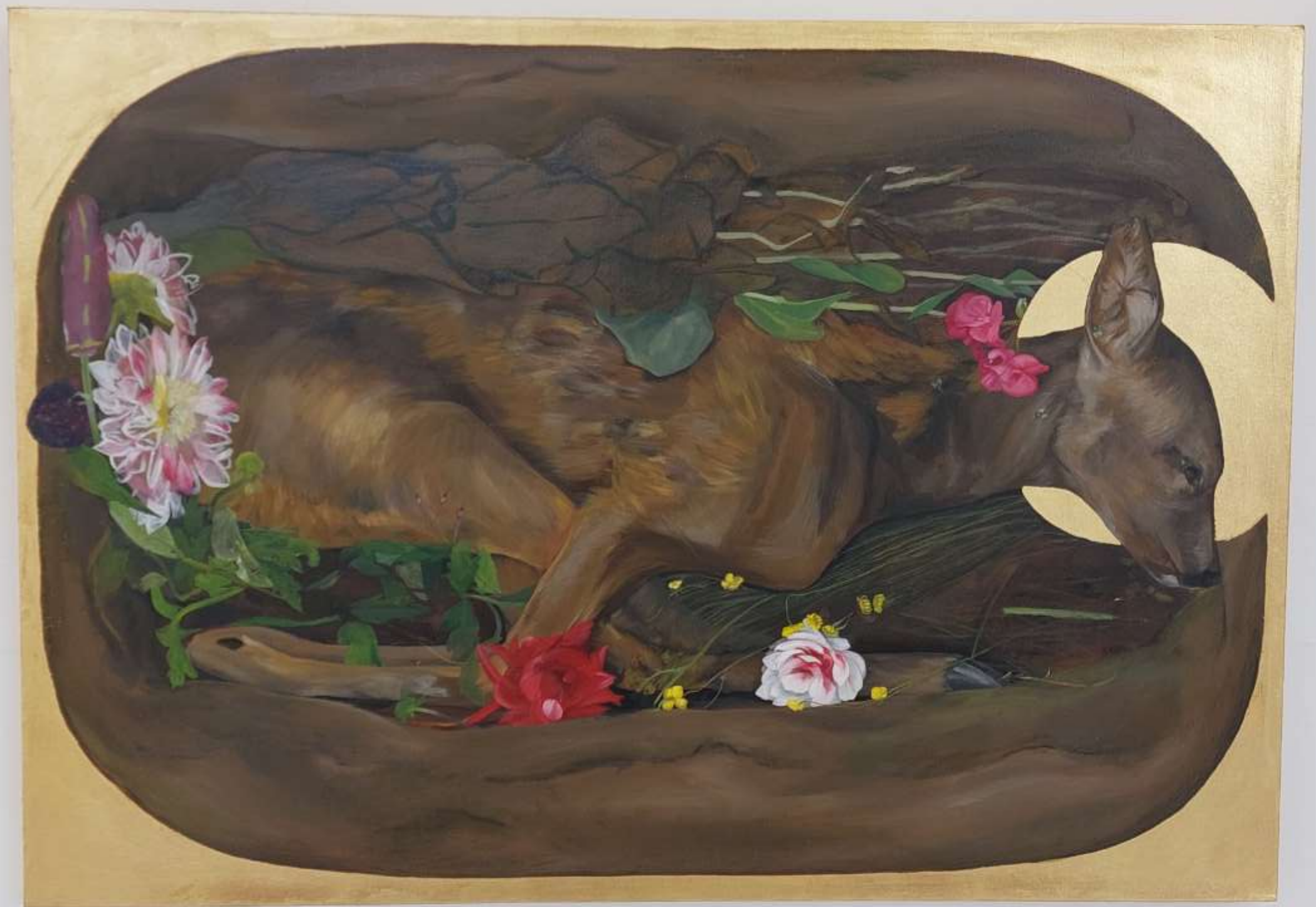
Burial , (2023), Rose Willis, Oil paint on canvas, 110cm x 85, Burial addresses the natural cycles of death, decomposition and life through the representation of a deer burial. The deification and beautification of this process is integral to removing the disgust towards death and grief.