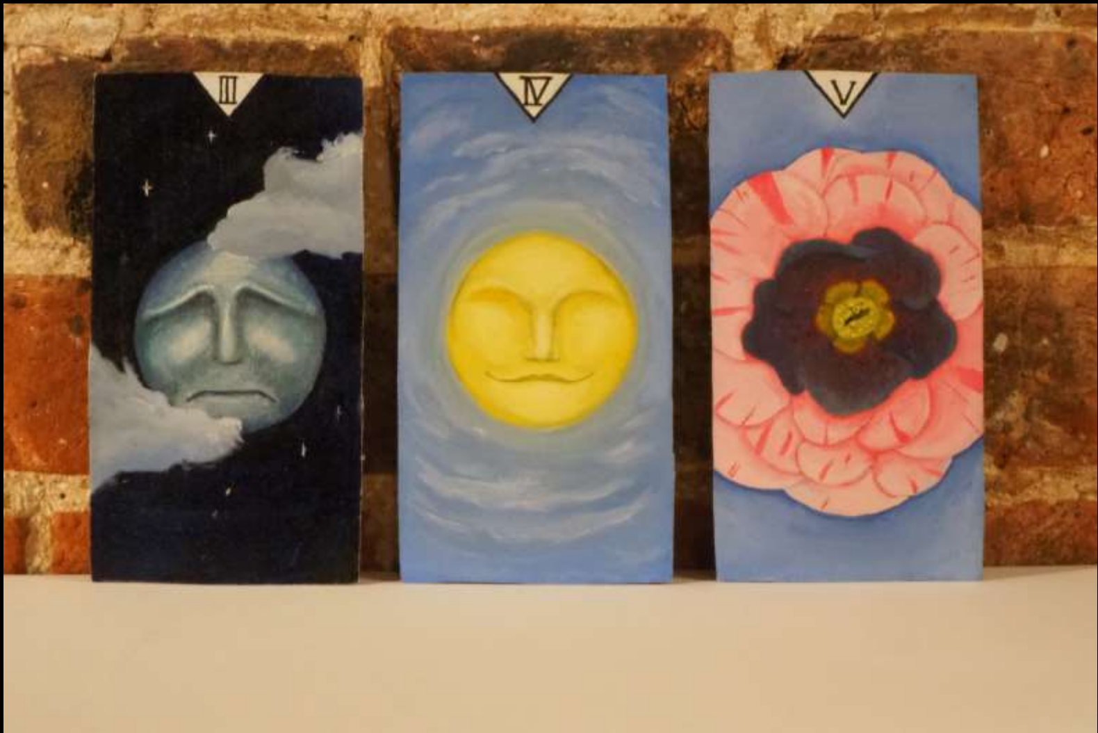
6 Tarot cards, (2019), Rose Willis, Oil paint and lino print on card, 15cmx10cm, These tarot cards are each my own interpretation of the fool, death, the tower, the moon, the sun, and the world tarot cards respectively, and backing inspired by the pagan phrase “as above, so below”.