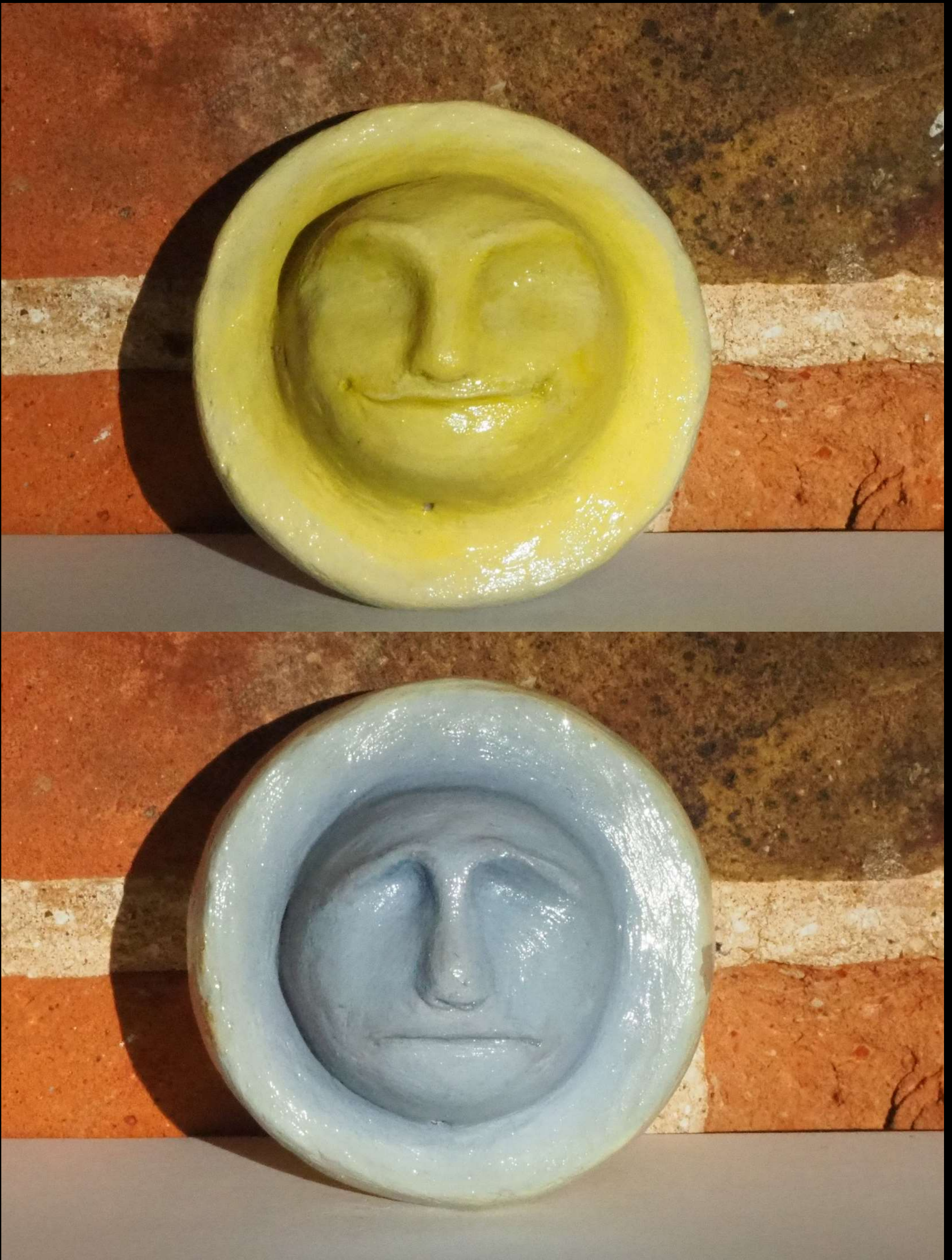
Sun and Moon , (2018), Rose Willis, Clay and acrylic paint, 10cmx10cm - This circular sculpture represents the cycles of the sun and moon, using themes associated with both to create a character for the two deities.