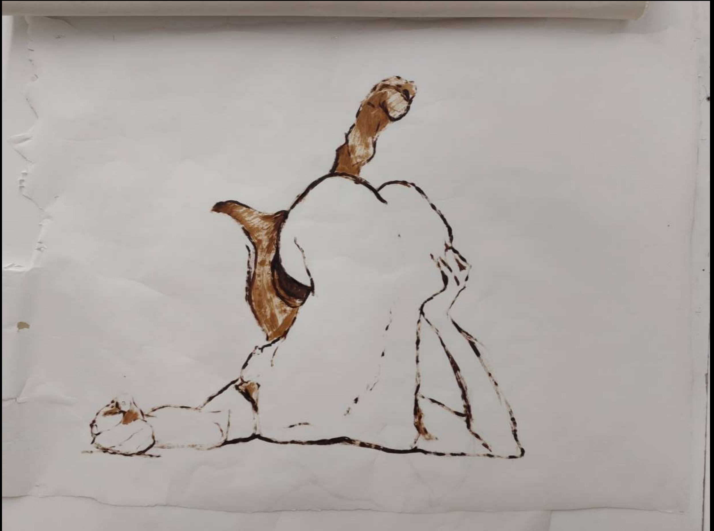
Untitled , (2023), Rose Willis, Oil paint on paper, 110cmx90cm, This work is part of a series of similar which explore self-objectification as a woman, depersonalising the female body and posing it in a provocative but jarring way to challenge the gaze of the viewer